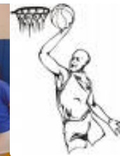
& Lion Bert!